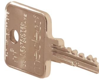
Biaxial m 3 Key Photo shown

If keys have been lost or stolen, we can reference the stamp number on the lock housings, cams or bolts if available.